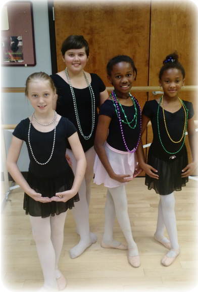
(pictured above) Ballet students having a blast during our final class before Mardi Gras!

Louisiana Academy of Performing Arts 2020 Dickory Ave. #200 Harahan, LA 70123 www.laapa.com | (504) 208-2301