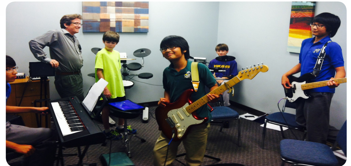
(Pictured above, the River Ridge School of Music & Dance Rock Band, jamming out this Summer!)

June 21 Spring Recital River Ridge School of Music & Dance St. Martin's Solomon Theatre